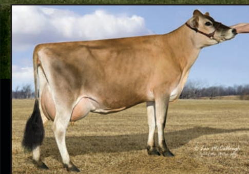
Above (L-R): JcJ Rebel 13192 VG-81%. Valley Oaks Alexanders Wedding-P EX-90%, At left (L-R): Forest-Glen Rebel Holiday, Alexander Lucky L Middle.