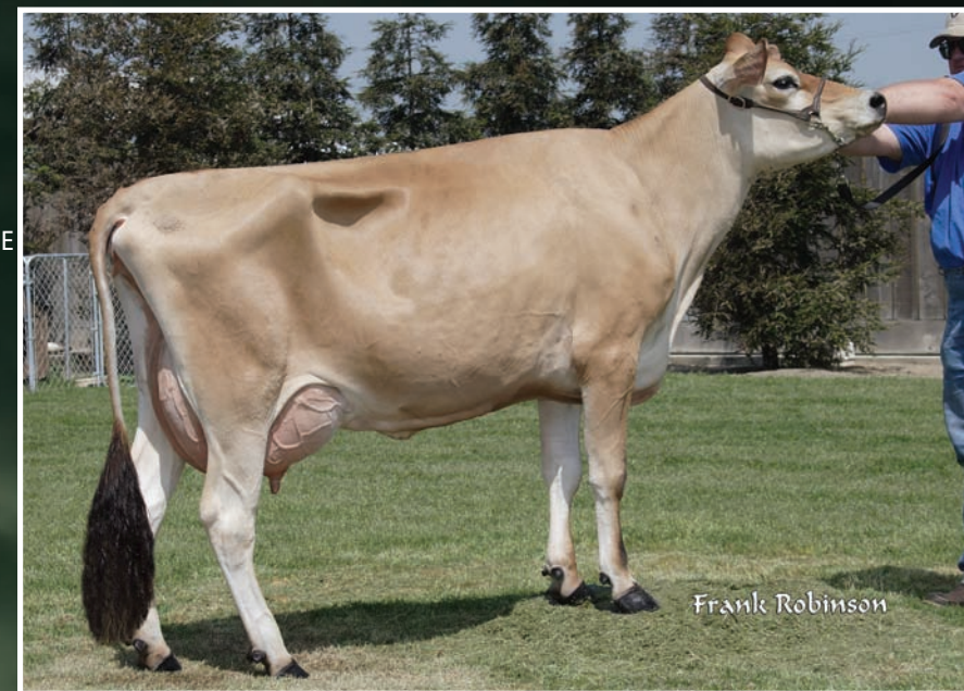
Dam: D&E Paramount Violet

High Genomic Value Young Sire Extreme Milk Longevity Sexed Semen Available!