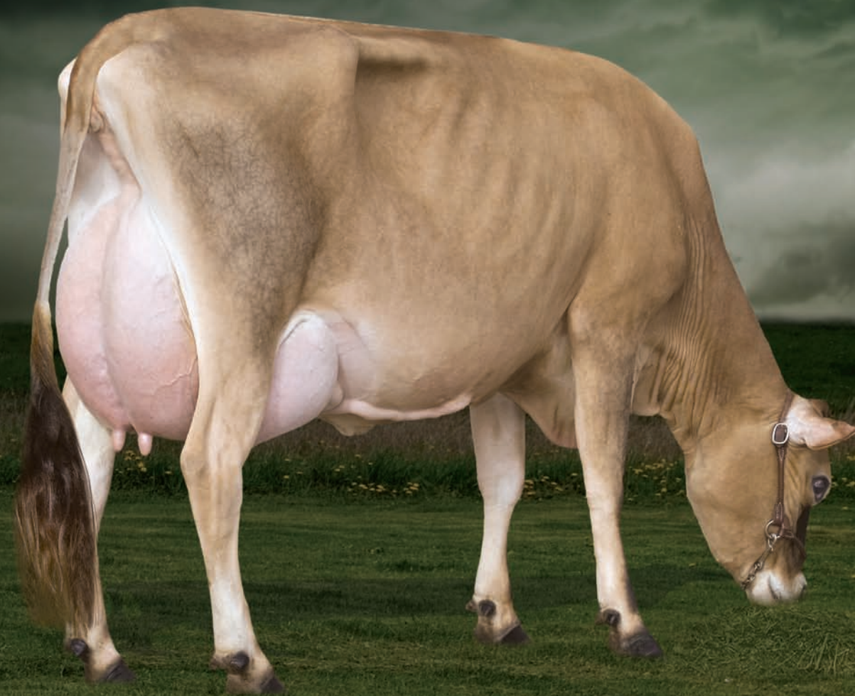
Above: GR Nymans Epic 7955 VG-81%. At left (L-R): Diamond-S Epic Kale; Diamond-S Epic Divine VG-84.

Shallow Udders Protein and Fat Percent Improver High Fertility Sexed Semen Available