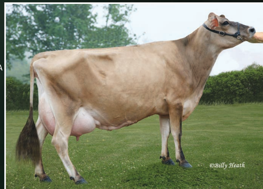
Dam: Wilderness Jace Lotto

Breed Leading Genomic Young Sire Productive Life Specialist Sexed Semen Available!