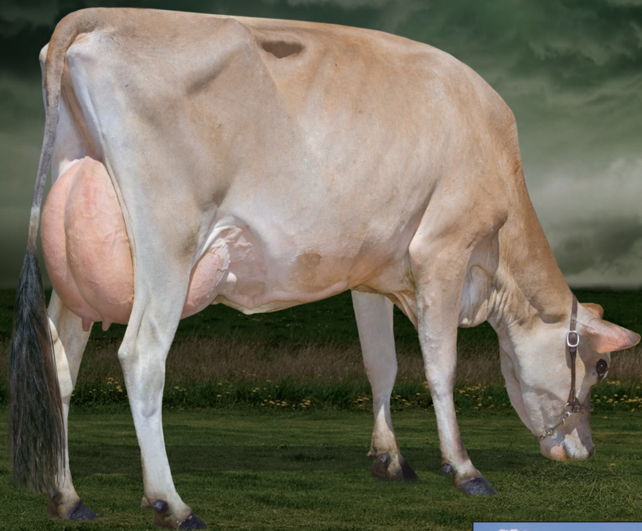
Above and at right: Wilsonview Access Jadis.

High Milk Action Son Great Type Beautiful Udders Sexed Semen Available!